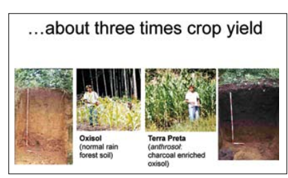
Figure 2. Cutaway view of tropical soils showing on left the normal rain forest soil where nutrients are transient and the Terra Preta de Indio soils with black carbon that is now attributed to human activities of transport of food, waste, and fuel at prehistoric dwelling places. Image credit Julie Major, plate taken from PowerPoint presentation by Folke Gunther cited in additional readings below

There is another type of tropical agriculture called slash and char which would promote soil fertility, allow for shorter rotation periods and also reduce dependence on chemical fertilizers. This farming technique was formerly practiced by the Amerindian people 500 to 2500 years ago was discovered independently in Asia. It is quite a simple concept actually, as these native Amazon Rainforest farmers had only stone tools and felling the forest for fresh, fertile ground was very difficult. Instead, they conducted a smothered combustion of agricultural debris, and supplemented this with domestic manure and household debris. This charcoal built up in the soil over time and became a durable substitute for soil organic matter. This black carbon lasts for ten's of thousands of years in the soil as opposed to a few seasons at best. The result is a soil with chemical and biological properties that convert unproductive tropical oxisols to fertile soils that are still farmed even 1000 years after the original people have disappeared.