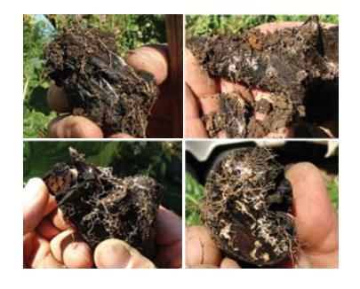
Figure 4. Here is the result of charcoal pretreatment. These charcoal pieces were left large for ease of observation and composted with urine, wood chips, cooking drippings other food waste. After several months the initially hydrophobic charcoal became water saturated and home for fungi and many macroscopic invertebrates. Several more months in soil with Swiss chard revealed plant roots actively growing into charcoal pore spaces. pretreatment research by Larry Williams