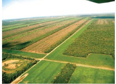
Figure 1. We see this agricultural practice underway in the Amazon River headwaters. In the upper portion bulldozers have chained the forest down in preparation for burning and lower center we see dark bands of potassium enriched soil from the ash deposited by the fires.

After recovery of the land the farmer then slashes and burns the accumulated vegetation and repeats this cycle. Hence the term Slash and Burn (Swidden) agriculture. Now prominent scientists are advocating a replacement with a new kind of agriculture - Slash and Char. A growing system that also has advantages in the temperate zone.