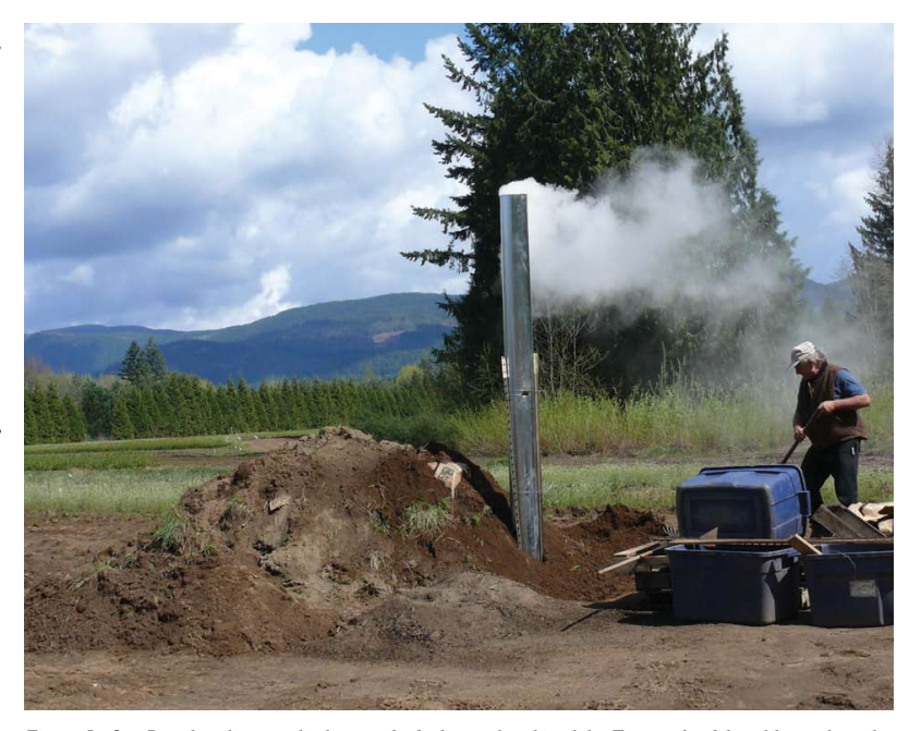
Figure 5. Our Brazil replica, top lit, bottom draft charcoal making kiln. Two cords of dry alder and maple covered with wet hay, cardboard and soil. On the third attempt it worked like a charm and gave us a 2-year supply of high quality charcoal for our research and great barbecues. See the reference below to the Flickr file for a step-by-step description.

Folke Günther, Holon Ecosystem Consultants, Lund, Sweden, Carbon sequestration for everybody: decrease atmospheric carbon dioxide, earn money and improve the soil, submitted to Energy and Environment, 3/27/2007. This article can be downloaded at: <u>www.</u> terrapreta.bioenergy lists.org