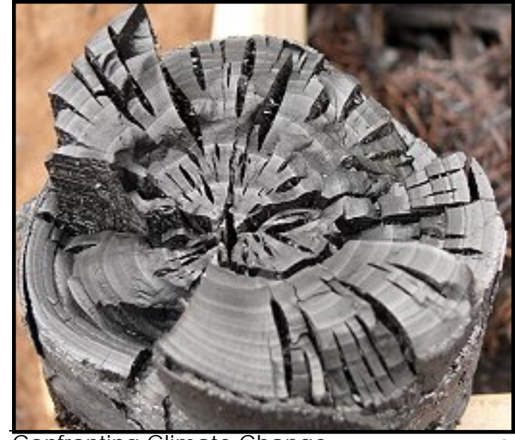
Confronting Climate Change

for Simultaneously Producing Bioenergy, Permanently Sequestering Carbon, while Improving Soil and Water Quality